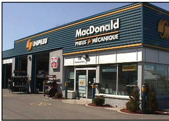
One of the MacDonald Tire locations at 11 Oka Road, Deux Montagnes

The Routliffes purchased MacDonald Tire in May of 1986. That was at the old location on de la Forge Street in St Eustache, and at that time there was only one employee. The business grew steadily and finally outgrew the old location. The past five years have seen relocation to 11 Oka Road and the opening of a second location at 301 Industriel Boulevard, with a total investment of more than a million dollars. They now employ up to twenty-two people.